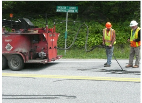
D. Filling of routed cracks with fill material.