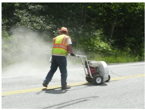
B. Cleaning the crack with a blower.