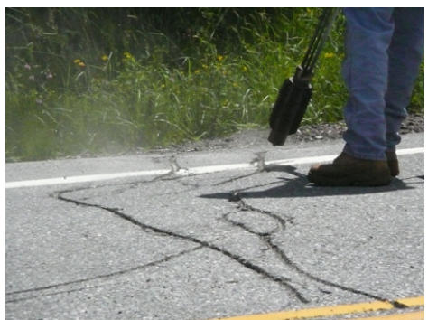
C. Further cleaning with a heat wand.