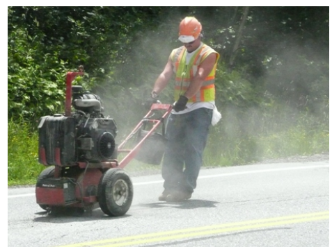
A. Routing the crack.

Installation of all materials at all locations was completed without incident. Figure 3 depicts a typical installation. In all instances, cracks were first routed with a routing cart, cleared off with a blower, further cleaned with a heat lance/blower, and the cracks filled via a wand that is attached to the kettle. On warm days, filled cracks can be cooled quicker with the application of a water spray.