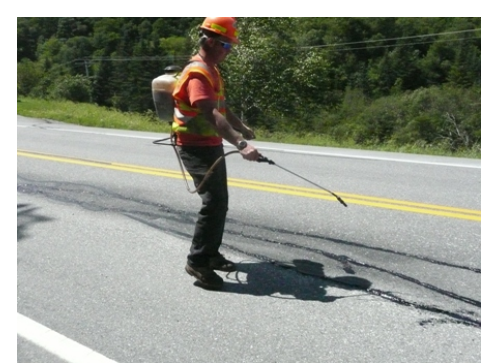
E. Water spraying to cool cracks quicker.

Figure 3 Steps of the Crack Filling Process.