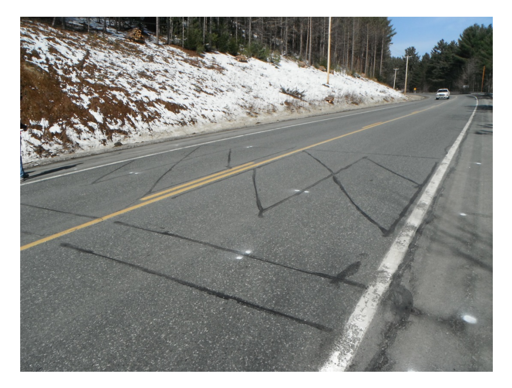
Figure 2 An example of a Manufactured Cracked Test Site

Manufactured sections contained no natural cracking, but rather a specific pattern was routed out and filled for a controlled comparison where both products would be tested within the exact same pattern (see Figure 2.) The manufactured test sites were also included in the project to study if tire tracking was a concern. Every test site stretches over both lanes of travel, and extends 100 feet lengthwise. Table 1 exhibits the different test site locations within each project location. For this project, the crack seal was evaluated in four different categories: spalling, adhesion, cohesion, and overall crack width spreading. Crack filling operations occurred between June 21 and July 1, 2010 in both locations. Test sites were chosen prior to material installation to determine pre-existing conditions but were not revealed to the contractor, with the exception of the manufactured sites.